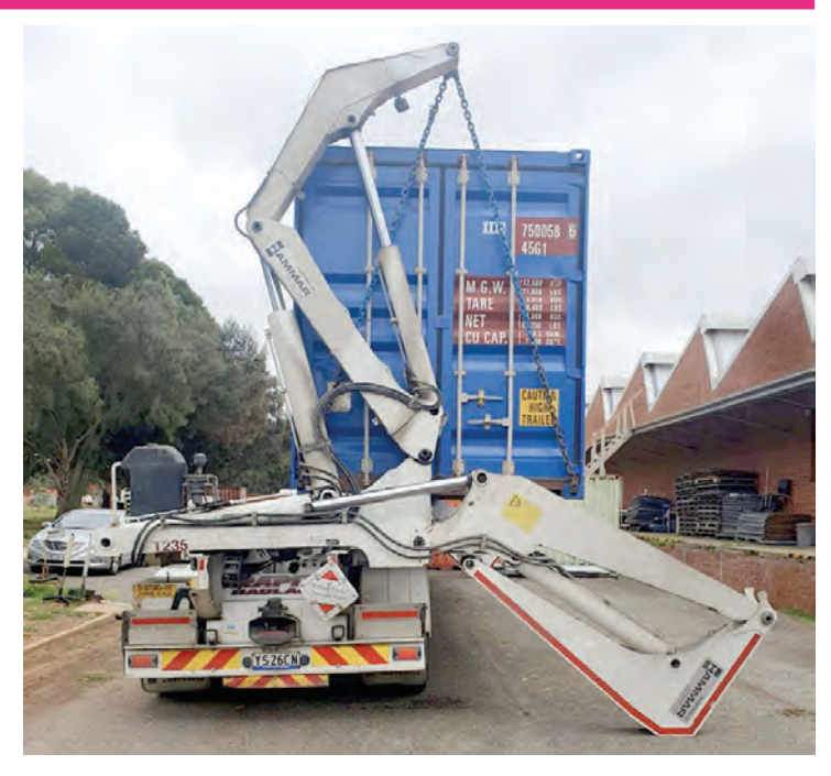
The shipping container starts its journey from Edinburgh to Port Adelaide

We're still accepting tax deductible donations for this hospital project to offset the transportation costs and hopefully, fund a second container.